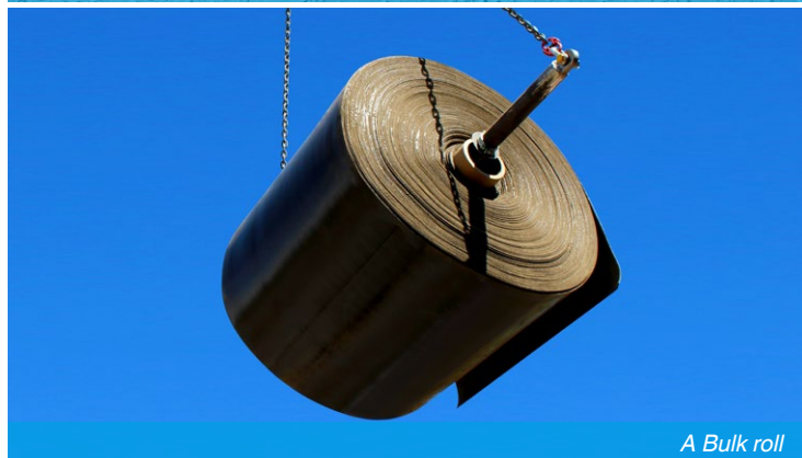
A Bulk roll