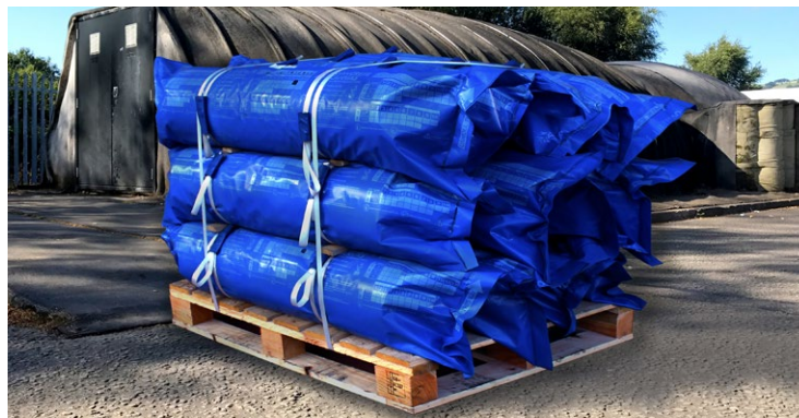
Hand portable Batched rolls